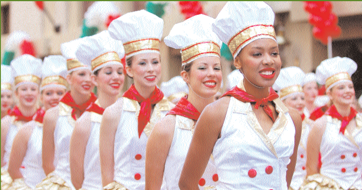
AT LEFT: The annual Neiman Marcus Adolphus Children’s Parade brings a host of sights, sounds and color to downtown Dallas each December.