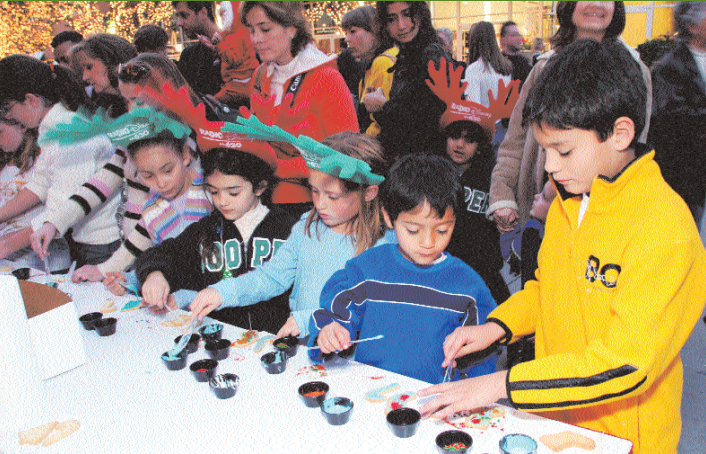
Children decorate holiday cookies at Lights of Legacy in Plano.

Corporate and community volunteer groups that helped staff home tours included Alliance Data, Children's, Downtown