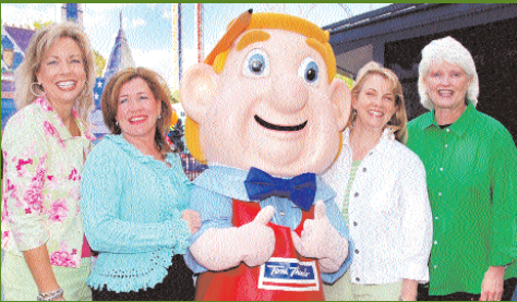
The Women's Auxiliary Family Night at Six Flags is one way Tom Thumb supports Children's each year.

support to Children's through a variety of different events and organizations. Tom Thumb is the presenting sponsor for the Women's Auxiliary to Children's annual Family Night at Six Flags and for the annual fun run organized for Wipe Out Kids' Cancer. Tom Thumb also sponsors other organization's efforts to reduce childhood obesity, prevent child abuse and provide health insurance for all children.